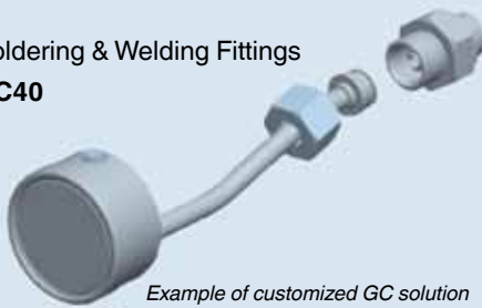
Example of customized GC solution